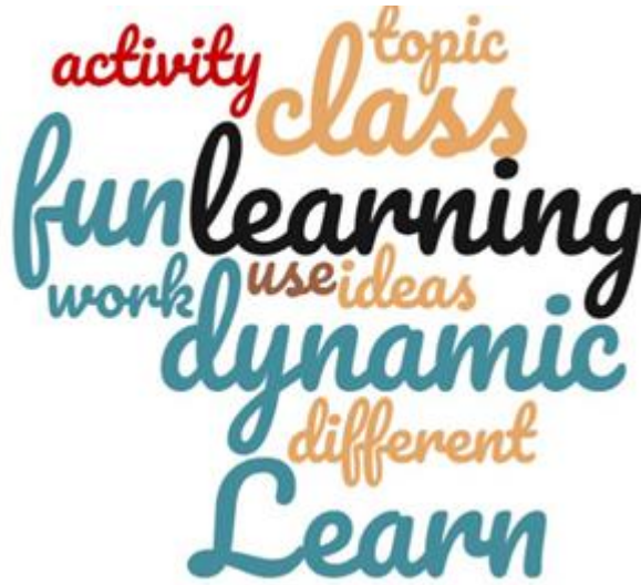
Figure 2. Word cloud about the use of the Collaborative Wall