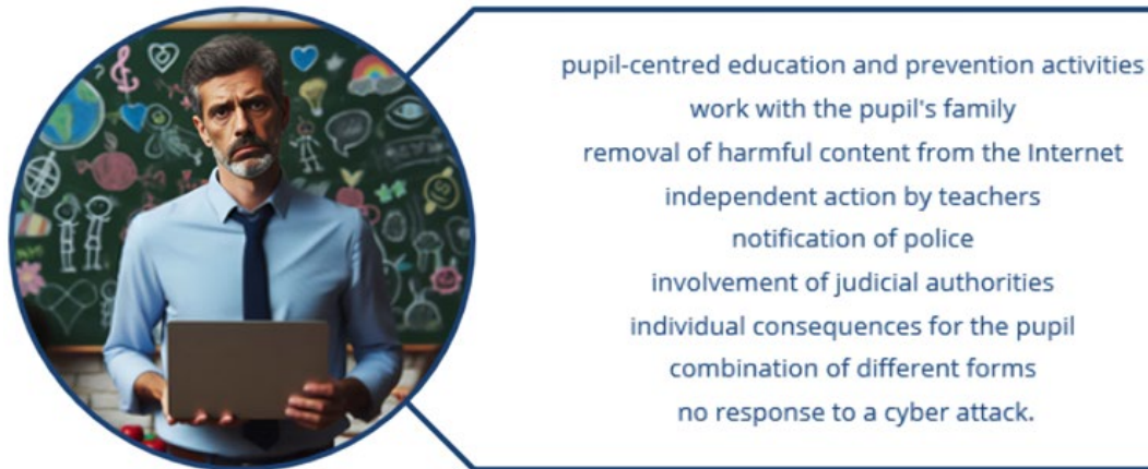
Figure 2. Strategies for dealing with problematic situations related to online attacks

style of use of ICT among young people, the reshaping of models of digital competence, and the changing awareness of digital safety among teachers.