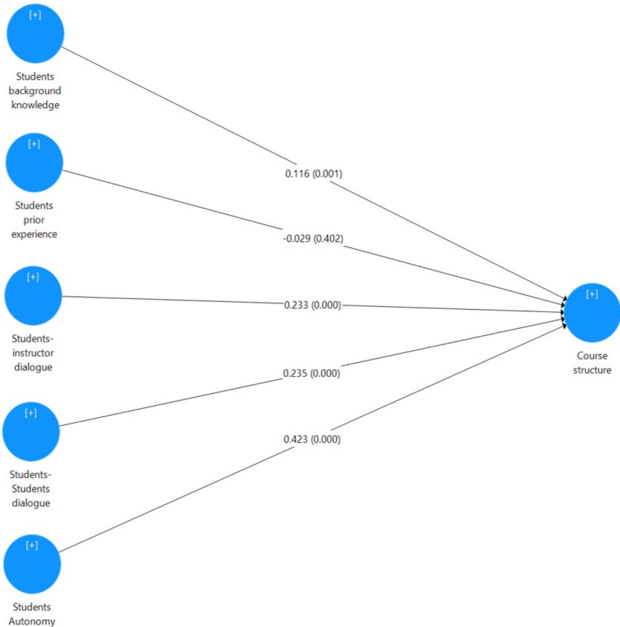
Figure 3. Structural model assessment

affect course structure, and the bootstrapping test showed a highly significant level of both indirect paths with \beta = 0.043 and \beta = 0.031 , respectively. However, the results revealed that Students' prior experience has an insignificant level with course structure ( \beta = 0.035 ).