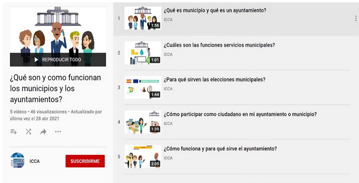
Figure 3. Images of links to five videos on YouTube (in Spanish)