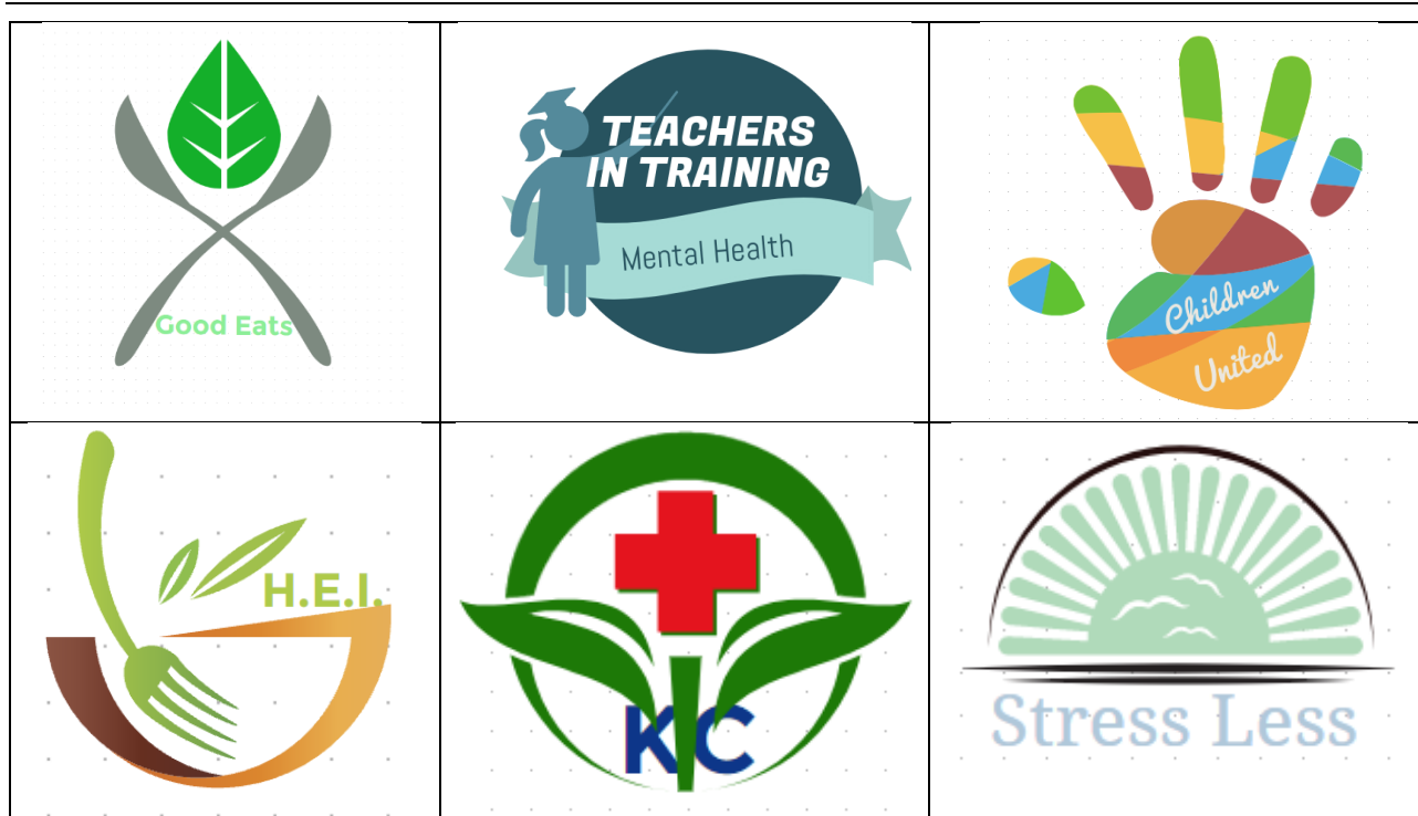
Figure 1. Public health students' design work related to logos

The instructional design procedures used in this course are known as the ADDIE approach which stands for “analysis, design, development, implementation, evaluation” (Branch, 2009, p. 2). The media that they designed could be used in their lesson plan and teaching. Students worked on this capstone assignment for eight weeks in groups of two or three students. The total number of the groups was 11. Students regularly recorded their analysis, design, development, implementation, and evaluation process into a shared Google document which was accessible to the instructors and the group members. Course instructors provided weekly consultation throughout the project. At the end of the eighth week, the students implemented their training with an authentic audience.