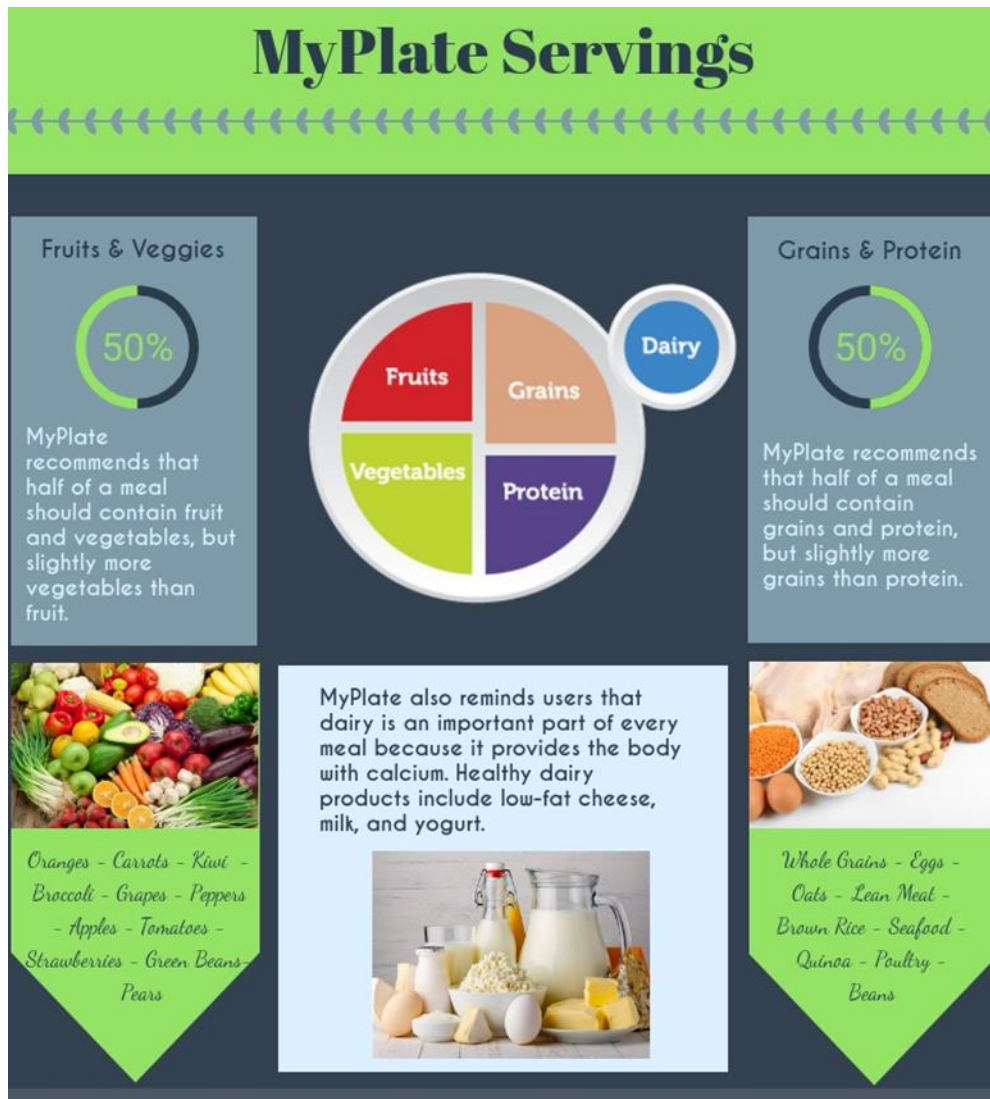
Figure 4. An example of infographic designed by the public health student group members

By giving our audience a quiz, we as instructors are able to receive evidence that our audience was fully engaged in our presentation the entire time and that they receive[d] the information correctly.